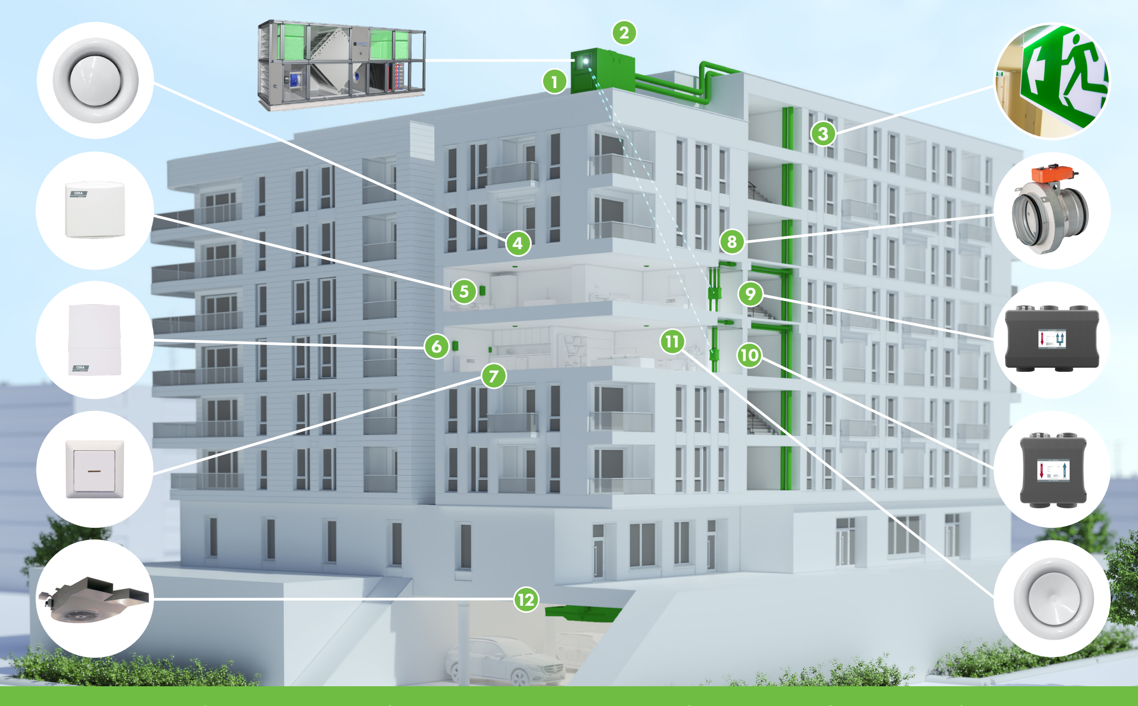
1. CONTROL PANEL | 2. AIR HANDLING UNIT | 3. STAIRWELL PRESSURISATION SYSTEM | 4. RETURN VALVE | 5. HYGROSTATE | 6. CO<sub>2</sub>-SENSOR 7. SWITCH | 8. FIRE DAMPER | 9. CERA-UNIT TYPE 2 | 10. CERA-UNIT TYPE 1 | 11. SUPPLY VALVE | 12. CAR PARK VENTILATION SYSTEM